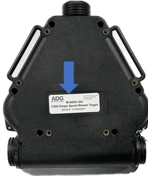
Serial Number Label Is Located On The Bottom OF The C420

We take the performance of our products very seriously and, accordingly, are taking all actions necessary to correct any potential performance inadequacies and deliver or return high quality units to you as rapidly as possible.